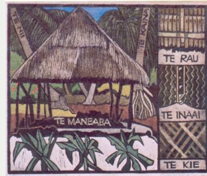
Fig 1.1 Artistic & Literary Works